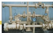
Stop #5 30 psig typical Industrial User Transfer Station