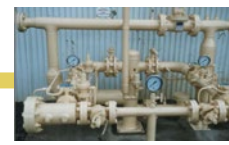
Stop #3 30 psig typical Sampling & Regulator Station