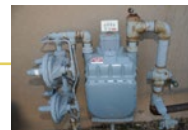
Stop #7 .25 psig (7 inH 2 O) Residential service

Images and pressures are representative and are not intended to reflect actual equipment or pressures used.