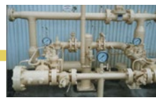
Stop #2 30 psig typical up to 60 psig Metering & Regulator Station