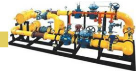
Stop #1 230 psig typical Citygate pressure reduction station 100-150 psig typical Power generator plants