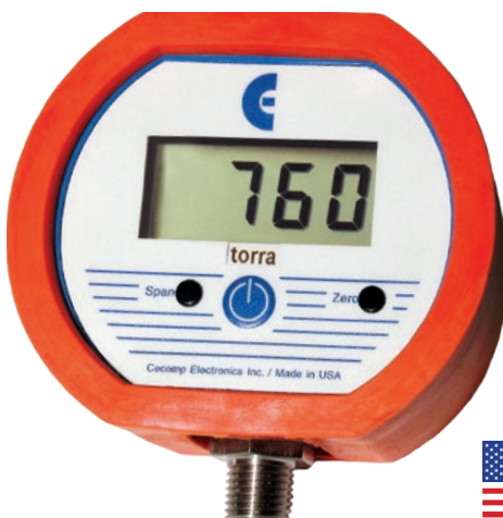
ARM760B with RB Rubber Boot