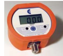
RB Rubber Boot