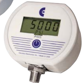
F4B 4 Digit Ranges, NEMA 4X