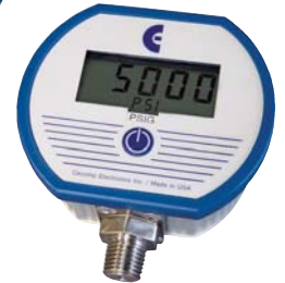
DPG1000B 4 Digit Ranges